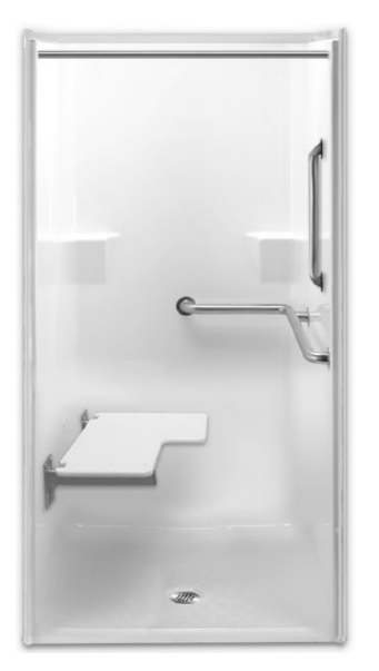
39"x39.5" ADA Tansfer Shower 1 Piece, Smooth wall APF3698BF625