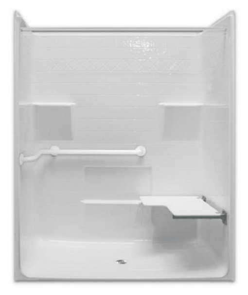
63"x34" ADA Roll-in Shower 1 piece 60"x30" inside dimension APF6334BF75