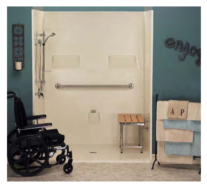
60"x49" Accessible Shower in biscuit 5 Piece Roll-in Shower APF6048BF5P