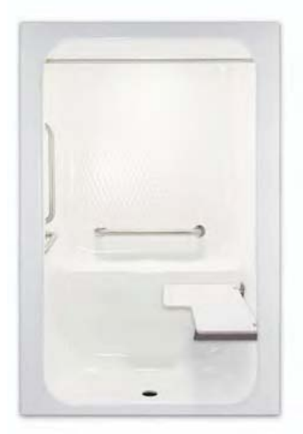
54"x48" Accessible Shower Acrylic One Piece APTH4848BF2