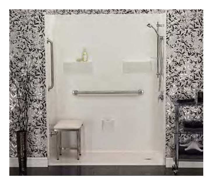
60"x31" Bathtub Replacement 5 Piece Accessible Shower APF6030BF5P