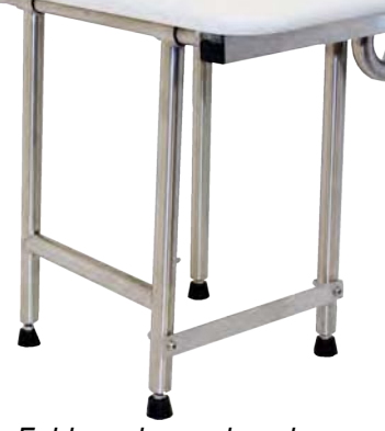
Fold up shower bench, APCSEA2215P shown

Shower curtain and rod, Premium nylon curtain shown